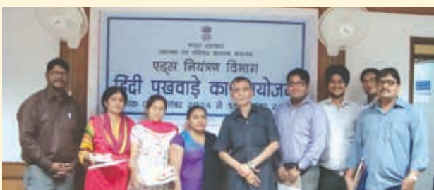
Prize winners of competitions organised during 'Hindi Pakhwada'

During this fortnight-long programme, various competitions were organised, such as Hindi Essay-Writing Competition, Hindi Noting & Drafting Competition, Official Language & General Knowledge Competition, Hindi Dictation Competition and Hindi Poem Recitation Competition. There was good response from employees at all levels who took part in these competitions in large numbers.