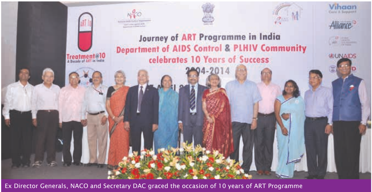
Ex Director Generals, NACO and Secretary DAC graced the occasion of 10 years of ART Programme

done. He remarked that the journey of the ART Programme in the country over the last decade has been challenging but there has been unprecedented scale-up, which reflects best practices in evidence-based planning and optimal utilisation of resources for expansion of services to attain universal coverage.