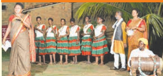
Community Resource Person addressing the gathering