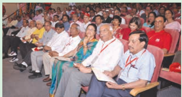
Audience at World Blood Donors Day function