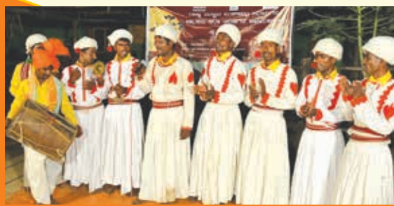
Dankara Gouliga Troupe