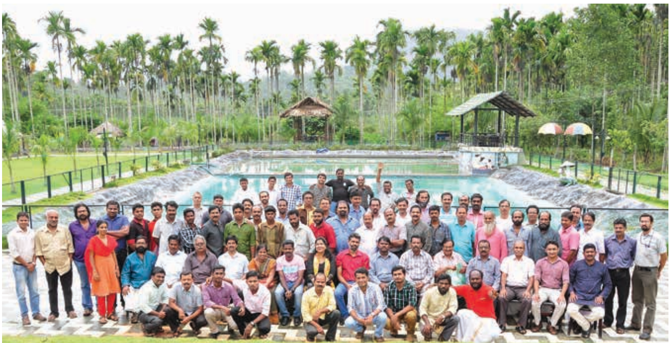
State level planning meeting with District Support Team, Folk Troupe Leaders, NACO & IEC Team, KSACS at District WAYANAD, Kerala