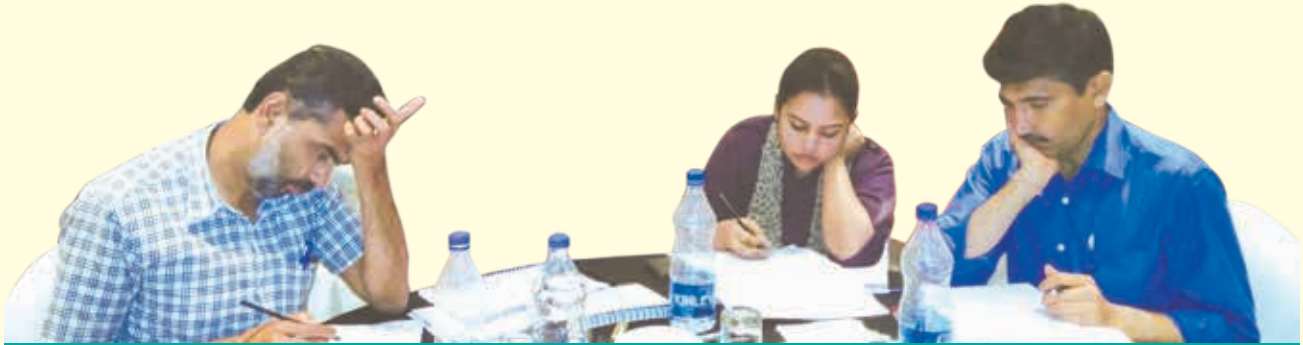
Participants engrossed in the task of developing the communication strategy

Considering that capacity-building and honing of skills on the job is essential to bring in uniformity and quality in programme outputs, training of all IEC staff members working at the State AIDS Control Societies (SACS) and Municipality AIDS Control Societies (MACS) was conducted during the month of June 2014 to build their capacities in communication planning and management. A cascading model of capacity-building was undertaken, whereby a team of senior officials—Joint and Deputy Directors (for IEC), Regional Communication Officers and the core team of IEC officers at NACO—were handpicked as master trainers to conduct the training of all state-level cadre working in the IEC divisions at the various SACS. A five-day training of master trainers (MTotT), supported by Integrated Healthy Behaviour Project (IHBP) was conducted in Delhi from May 26 to 30, 2014, to orient them on facilitating the training of IEC cadre from SACS/MACS. The MTotT was facilitated by external experts and resources from DAC and IHBP; altogether, 16 participants received the training