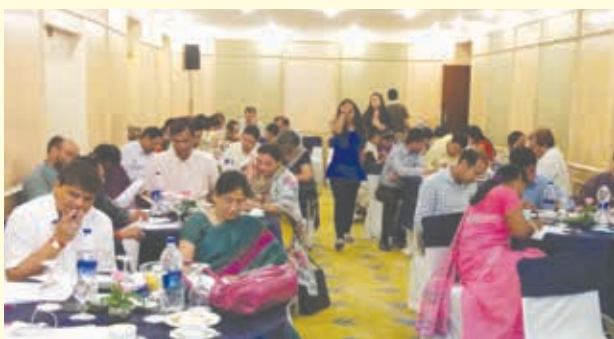
Participants carrying out the context and people analysis

The next level of training is planned at the state levels, which will be for two days, for the Programme Managers of DAPCUs and the Project Officers of Targeted Intervention (TI) projects. Joint and Deputy Directors from SACS IEC units will be oriented to conduct the trainings and NACO officers will monitor and provide necessary support.