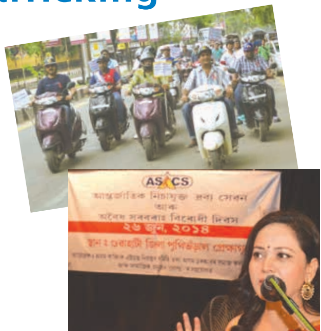
International Day against Drug Abuse observed with motorbike rally and speeches

The speakers stressed that everyone must fight against drug abuse and illicit trafficking and drug users should not be ostracised, but rehabilitated. They appealed to the youth community of Assam to join hands to fight against the menace of drug abuse. The state level meeting was preceded by a bike rally on drug abuse awareness which was organised by Maruwari Yuva Manch.