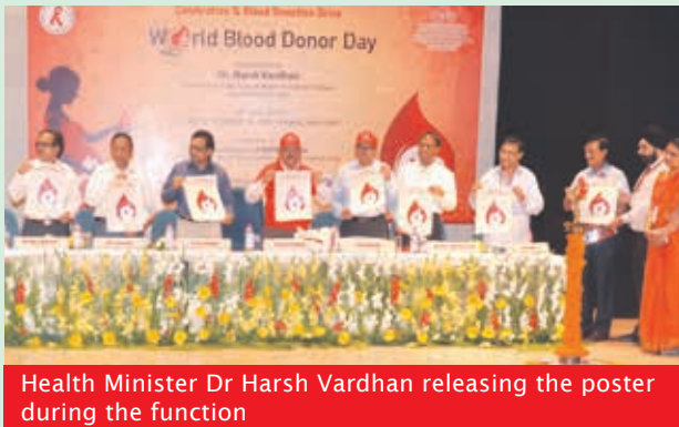
Health Minister Dr Harsh Vardhan releasing the poster during the function

World Blood Donor Day is celebrated every year on June 14 in homage to Karl Landsteiner, the Nobel Prize Laureate who discovered the ABO blood-group system. The Day is also observed to raise awareness about the need for safe blood and blood products and acknowledge the role of voluntary blood donors who are an important part of the blood transfusion services. The theme for the year 2014 is 'Safe Blood for Saving Mothers', which primarily aims to increase awareness about timely access to safe blood and blood products as part of a comprehensive approach to prevent maternal deaths.