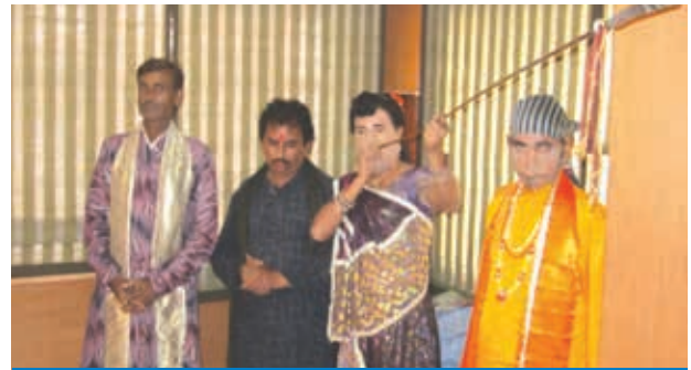
Shahir Pawada folk team of Gujarat

Enacting NACO-vetted scripts targeting youth, women, migrants and the general population, the troupes delivered key Behaviour Change Communication (BCC) messages on prevention of HIV/AIDS and STI and on creating awareness about availability of services of ICTCs/FICTCs, STI Clinics, ART and Linked ART Centres nearest to the villages covered by the programme. Promotion of voluntary blood donation was also highlighted in every folk performance.