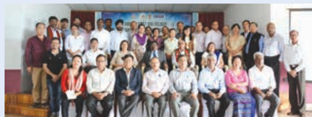
Participants from NACO and State AIDS Control Societies of NE States and North East Regional Office