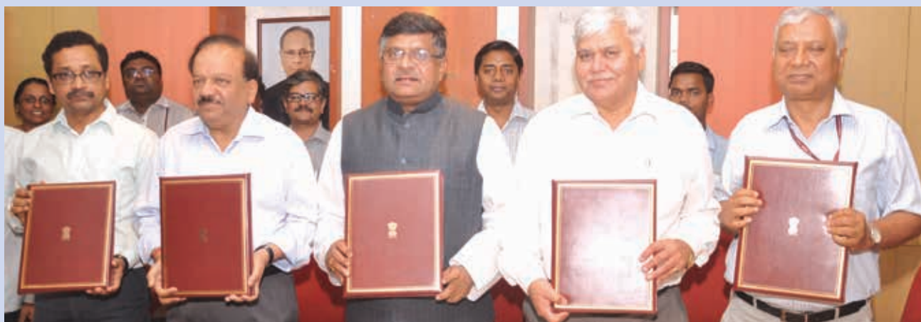
Signing of two MoUs between Department of Electronics and Information Technology (E & IT), Department of Telecommunications and Department of AIDS Control by Hon'ble Minister of E & IT Mr Ravi Shankar Prasad and Hon'ble Minister of Health & Family Welfare Dr Harsh Vardhan. Secretaries of all three Departments were also present on the occasion.

3. NACO has signed a separate Memorandum of Understanding with the Department of Electronics & Information of the Ministry of Communication & Information Technology with the objective of reaching large numbers of people through the Common Service Centres, with information on prevention and services of HIV. This will also encourage voluntary blood donation and also facilitate access to social protection schemes.