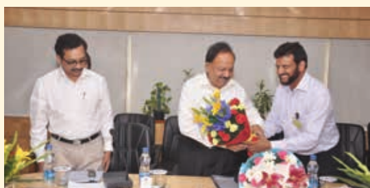
Secretary and Jt. Secretary welcome the Minister of Health & Family Welfare

Dr Harsh Vardhan, the Hon'ble Union Minister for Health & Family Welfare, visited the Department of AIDS Control (DAC) on June 12, 2014, to review the activities undertaken by the Department. He appreciated the successes achieved by India in the control of HIV/AIDS and hailed the collaborative efforts of the Department, communities and all partner agencies and institutes. He advised the Department that besides promoting condoms, communication strategies should also promote safe behaviour patterns and strengthen the cultural values. He underlined the importance of scaling up voluntary blood donations. He highlighted the need to focus on prevention of new infections in such regions and states