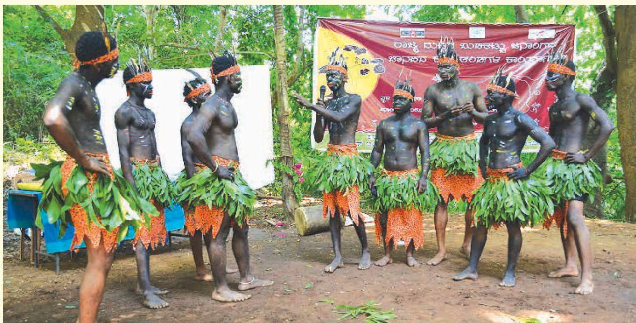
Amazing Siddhi Boys, a tribal male team from Uttarakannada