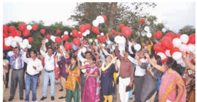
Participants released balloons to mark the grand finale

Various dignitaries who spoke on the occasion said that it is important, even as the successes are celebrated, to look back, analyse and learn, as the Programme embarks on its future journey. They emphasised that achievement should not make us complacent and success should not