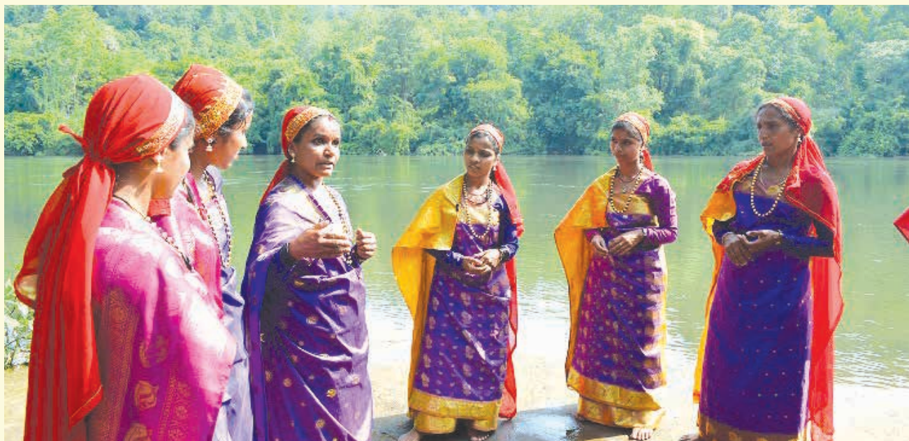
Performance by the Malekudiyar, women tribal team from Madekeri district

State level Master Trainers and Resource Persons, who have expertise in tribal folk art forms and tribal dialects, trained the folk troupes as per NACO guidelines in coordination with Karnataka State AIDS Prevention Society (KSAPS) IEC team. The scripts developed in the workshop were vetted by the technical team of KSAPS. A total of 70 tribal folk artistes from 11 selected folk troupes participated in the five-day workshop. All the trained troupes have fanned out to the remote