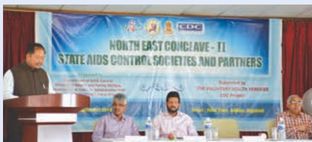
Health Minister of Nagaland Mr P. Longon speaking on the occasion