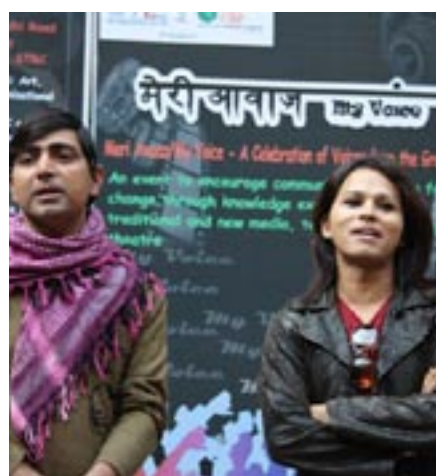
Transgenders put up creative performances

The event which was specially conceptualised and designed was held on December 15, 2009 at the India Habitat Centre in New Delhi with the support of UNDP, Delhi State AIDS Control Society and CFAR and the engagement of NACO and UNAIDS.