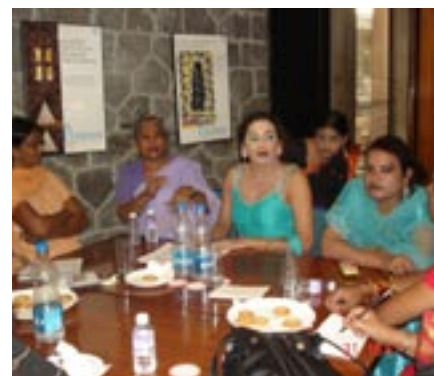
Participant at the National Transgender Consultation meeting is being held in New Delhi

economic minorities. UNDP has recently been identified as the lead UN agency to work on the issues of sexual minorities.