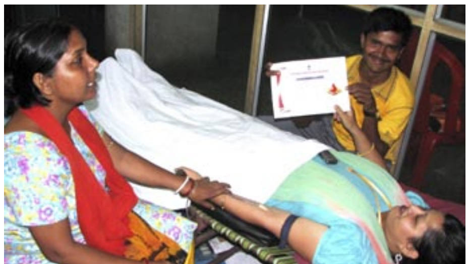
A volunteer donating blood on the occasion of National Voluntary Blood Donation Day

Nagaland State AIDS Control Society joined the rest of the