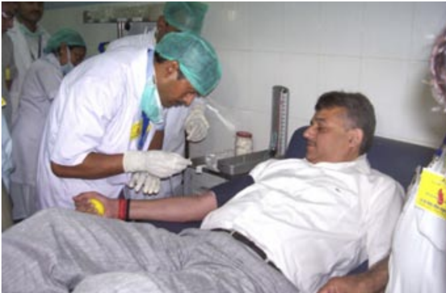
Hon'ble Health Minister of Uttar Pradesh, Shri Anant Kumar Mishra donating blood on National Voluntary Blood Donation Day

country in observing the NVBDD on October 1, 2009 by organising a state level function in Dimapur and district level events in Kohima and Mokokchung.