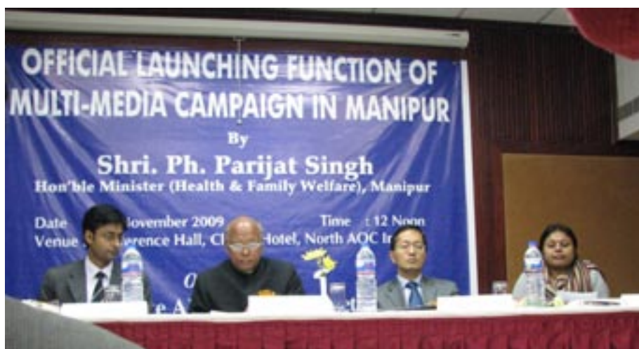
Delegates during the launch of Multimedia Campaign in Manipur

In Mizoram, the campaign was launched by UNODC in partnership with the Mizoram State AIDS Council on October 13, 2009 by the Hon'ble Minister for Health and Family Welfare, Government of Mizoram. Nearly, 98 members of RRCs from