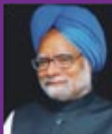
Shri Manmohan Singh Hon'ble Prime Minister of India

I humbly request you all to spread information on these issues among your peers. By doing this, we can make a big contribution in the spread of health related information and knowledge."