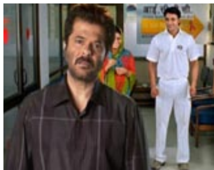
A TV spot with actor Anil Kapoor urging people to go in for HIV testing

Kapoor, who was recently in the spotlight for having essayed a key role in the Oscar winning Slumdog Millionaire, and Sushmita Sen, India’s first beauty queen crowned with the Miss Universe title and an actress known to be “intelligently