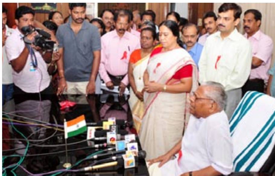
Chief Minister Shri V. S. Achuthanandan addressing the press conference on World AIDS Day 2009

KSACS organised an intensive campaign for the promotion of voluntary blood donation in the state throughout the week. 28 voluntary