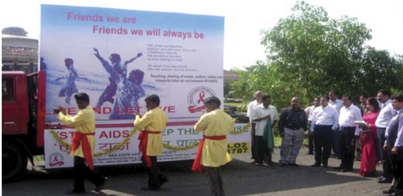
A street performance during the World AIDS Day campaign in Goa