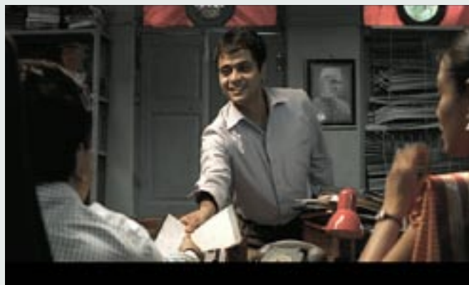
A snapshot of the commercial "Karke dekhiye, accha lagta Hai"

A television commercial titled "Birthday Boy" produced by BBC Worldwide Service Trust, in collaboration with NACO, was released on the occasion of the National