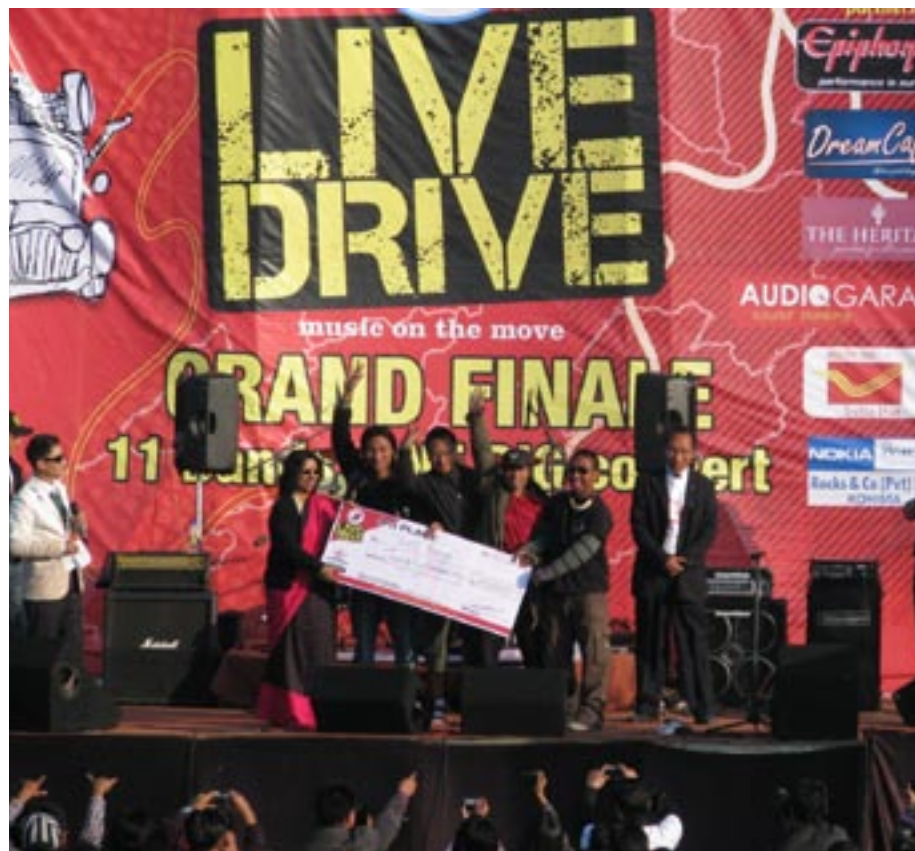
Award Ceremony in the Grand Finale of the 'Live Drive Music on the Move' in Nagaland

The multimedia campaign in Nagaland was implemented by the Nagaland State AIDS Control Society under the guidance of Hon'ble Minister for Health. The 'Write a Song Contest' was conducted through open advertisement where youth were encouraged to write songs on HIV/AIDS. Altogether, 60 entries and lyrics were received from musicians across the state. The 10 best selected lyrics were composed into songs,