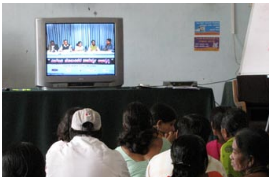
Participants during the satellite programme for PLHIV

For children living with HIV, fulfilling their dreams of basic and advanced education were of paramount importance. A young boy from Davangere pointed to the higher nutritional needs of children