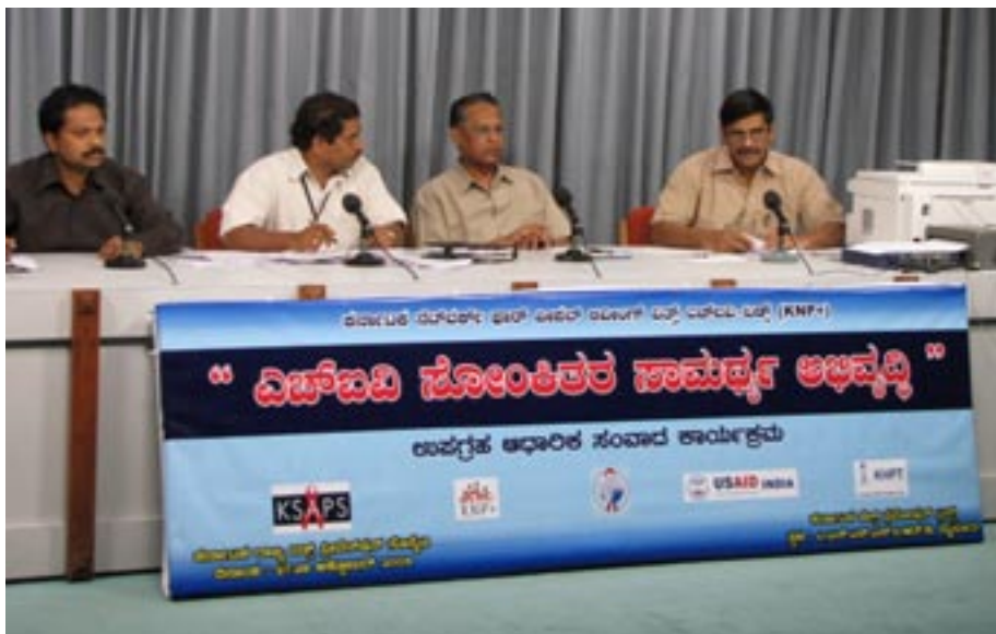
A panel of speakers during the two-day interactive programme in Karnataka