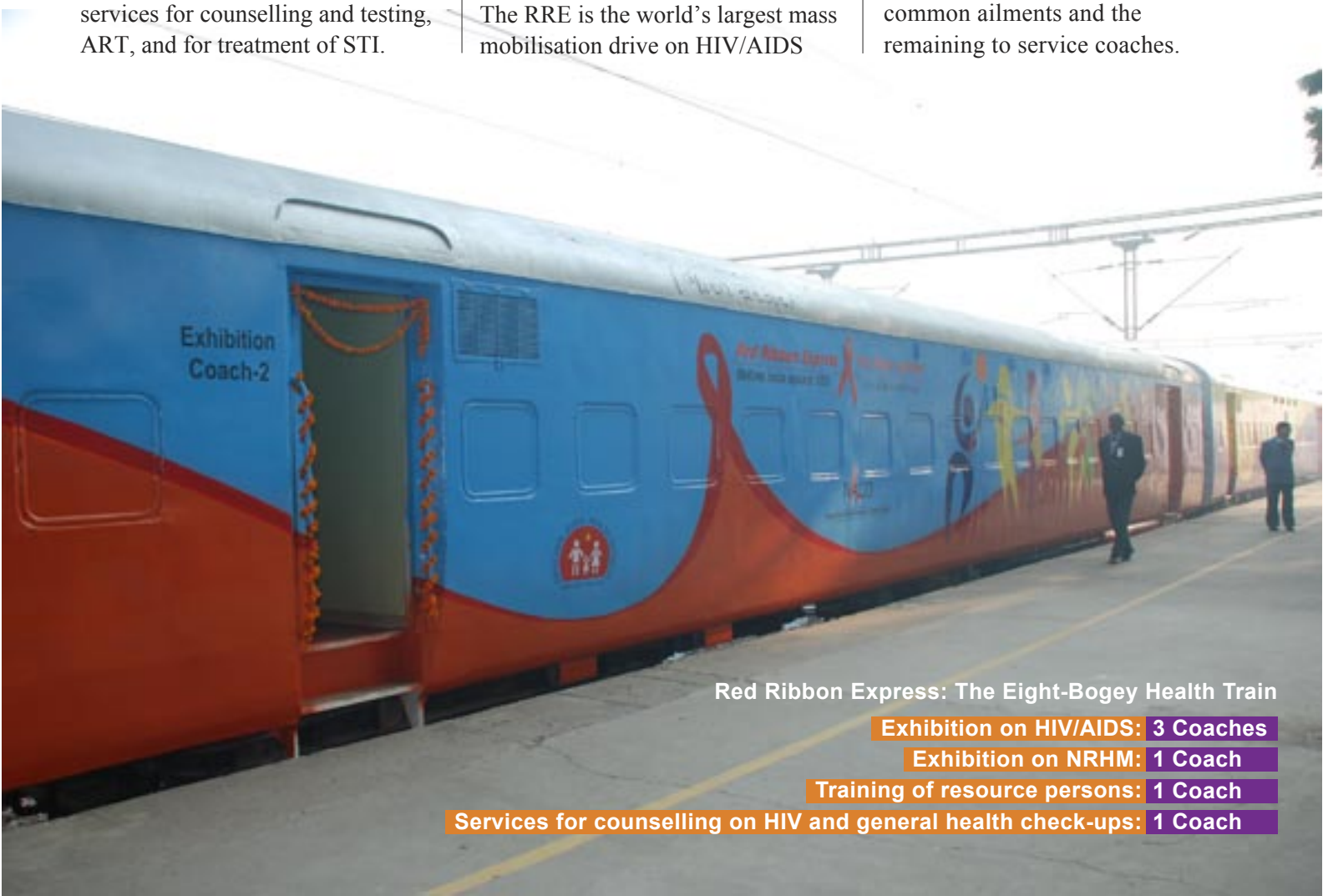
Red Ribbon Express: The Eight-Bogey Health Train

The train has been designed keeping in mind all the feedback that was received during its earlier run. The eight-coach train has four exhibition coaches with three having displays and interactive models on HIV/AIDS, and one devoted to NRHM issues. There is a training coach to train district resource persons drawn from different stakeholders such as Panchayati Raj Institutions (PRIs), Self-Help Groups (SHGs), Anganwadi Workers (AWWs), teachers, youth groups, police and armed force personnel. Sixty resource persons can be trained in one session. Three to four sessions are being organised everyday. The objective is to strengthen district capacity to respond to HIV/AIDS. The sixth coach has provisions for counselling and treatment of common ailments and the remaining to service coaches.