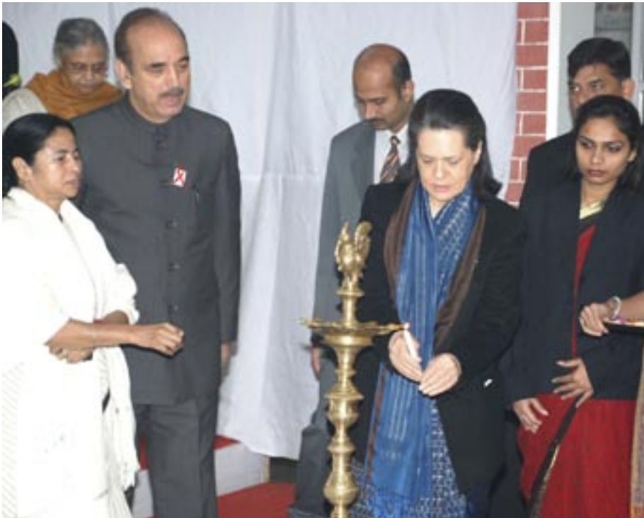
Smt. Sonia Gandhi, Hon'ble Chairperson, UPA lighting up the lamp during the inaugural ceremony of the Red Ribbon Express, Phase-II

The RRE has kept the promise it made in 2008 and returns with an expanded agenda that includes awareness on H1N1, Malaria, Reproductive Health and general health