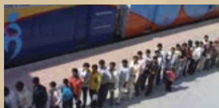
Visitors lined up at the platform to welcome the Red Ribbon Express in Gujarat

The RRE chugged into the Palanpur station on December 20, 2009, and had a captive audience during its two-day stay. Women, SHGs, ASHAs and AWWs availed of information and services to update their knowledge on HIV and reproductive health – things that they felt would come handy as they interacted with village folk on their daily rounds. From here the train moved to Bhavnagar, Botad, Wankaner and Bhakti Nagar.