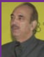
Shri Ghulam Nabi Azad Hon'ble Minister for Health and Family Welfare

"It is everyone's responsibility to learn about HIV/AIDS, to stay free from infection and not stigmatise those who are living with HIV. This would enable them to come forward, avail health services and make India a healthy and vibrant society."