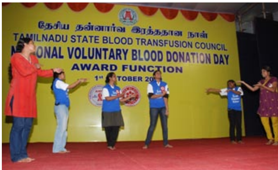
A skit being performed during the World AIDS Day programme in Tamil Nadu