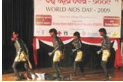
"Prince" Group presenting a cultural programme on HIV/AIDS

The youth were also mobilised and a musical night was organised at Ekamra Haat, Unit III, Bhubaneswar in collaboration with Action Aid India, Orissa state office. Over 500 youngsters witnessed the programme.