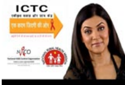
Sushmita Sen in a recent AIDS promotion campaign by NACO

Johns Hopkins Bloomberg School of Public Health Center for Communication Programs produced two versions of a Public Service Announcement (PSA) titled “Gaayab” (which in Hindi means to vanish) for NACO, which featured two eminent Bollywood actors – Anil Kapoor and Sushmita Sen.