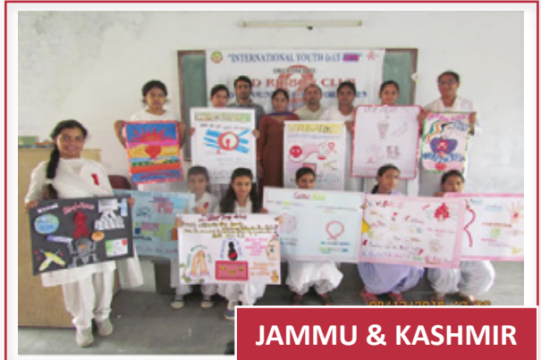
JAMMU & KASHMIR