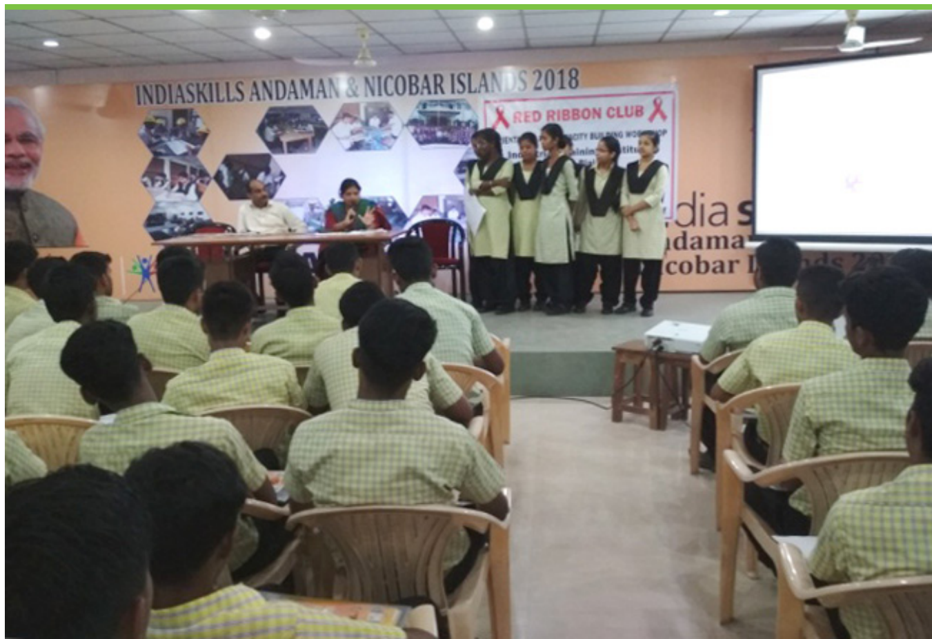
Sensitization Workshop on HIV/AIDS, TB and Reproductive Child Health programme

Andaman & Nicobar AIDS Control Society conducted a Sensitization Workshop on HIV/AIDS, TB and Reproductive Child Health programme at Dairy Farm Community Hall on 11 th