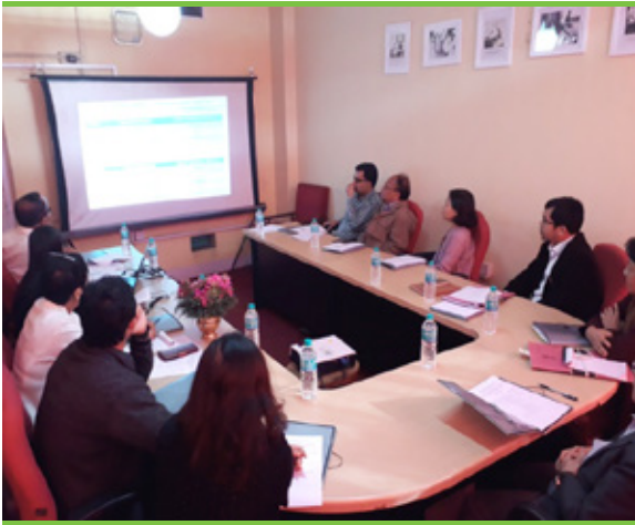
Participants during the State level meeting of the Joint Working Group with Education Department