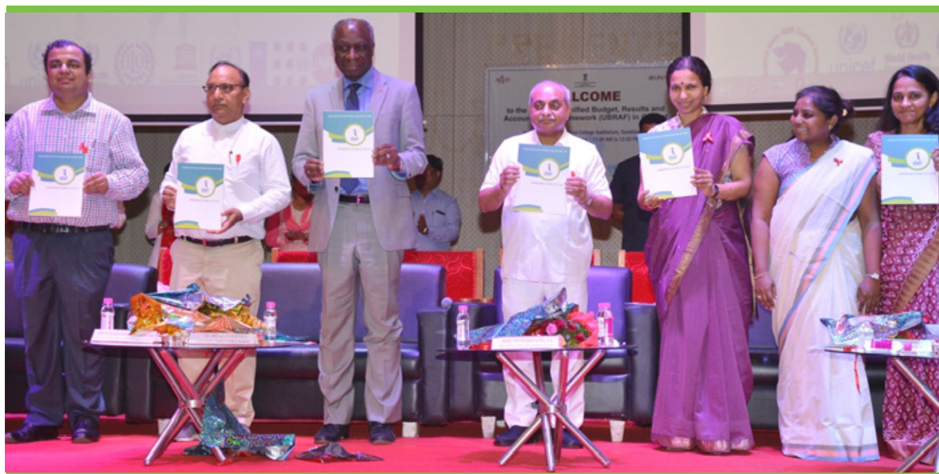
The release of a book of case-studies of 53 HIV+ women and their struggle for an equitable life during the launch of pilot project UBRAF