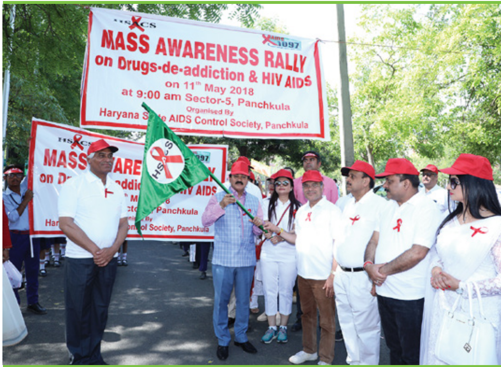
Flagging off during Mass Rally in Haryana

A mass awareness rally on HIV/AIDS was conducted on 11 th May, 2018 in lieu of Drug Abuse and Illicit Trafficking Day. This rally was conducted by Haryana State AIDS Control Society in collaboration