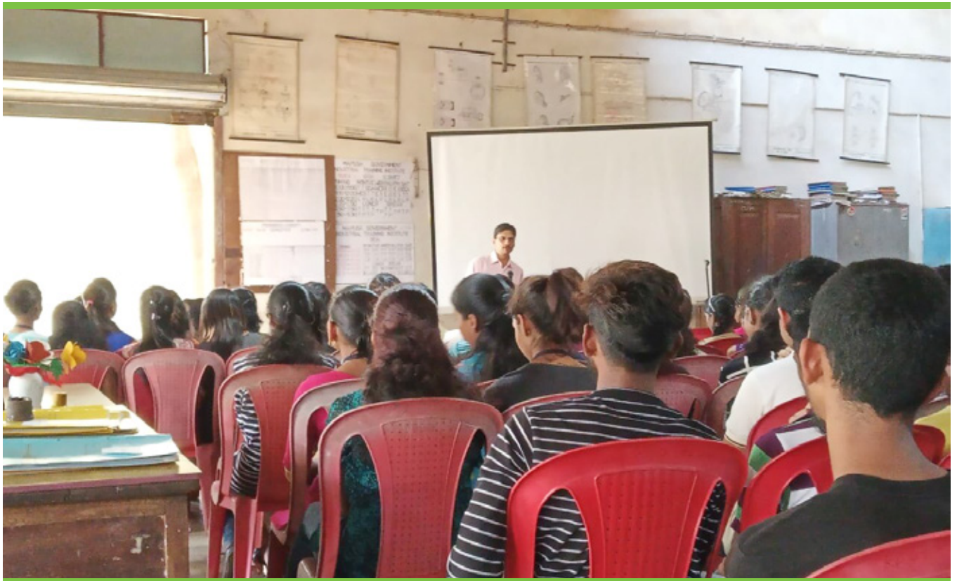
Students sensitized during Session on HIV/ AIDS Program in Goa

The HIV/ AIDS Sensitisation Programme was held for students of Mapusa ITI, Peddem Mapusa on 28 th November, 2018. Jr. trade trainees of COPA, Electronic Mechanic, ICTSM, MMV, SP and Electrician trades had participated