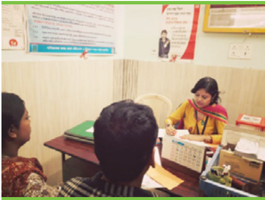
Counselling during ART service in ICTC

In order to minimize delay in ART initiation for HIV infected pregnant women and to provide all prongs of PPTCT services under one umbrella, a pilot project i.e. ART service at ICTC for newly detected positive pregnant women and their family members, has been implemented in West Bengal in collaboration with SAATHII in Sagore Dutta Medical College & Hospital. The program aims at ART initiation, including baseline testing, management of Opportunistic infections, necessary referral and linkages and subsequent lifelong follow up by the facility where ICTC is situated.