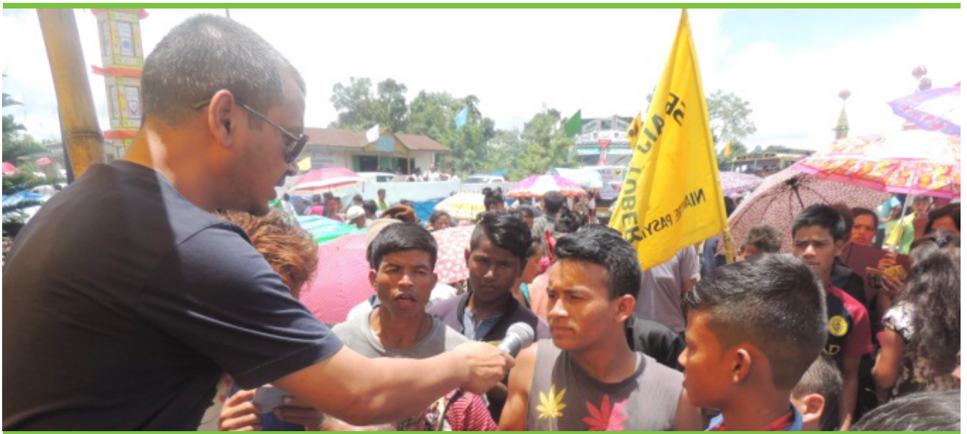
Awareness Campaign during Tuber Behdeinkhlam festival

Faithful of the Niam-Tre, Niam-Tynrai of the Sein Raij Tuber - biggest amongst the Sein Raijs- a religious organization in Jaintia Hills celebrated the most colourful religious festival which began on 16 th July and culminated on 19 th July, 2018 at the Biar or