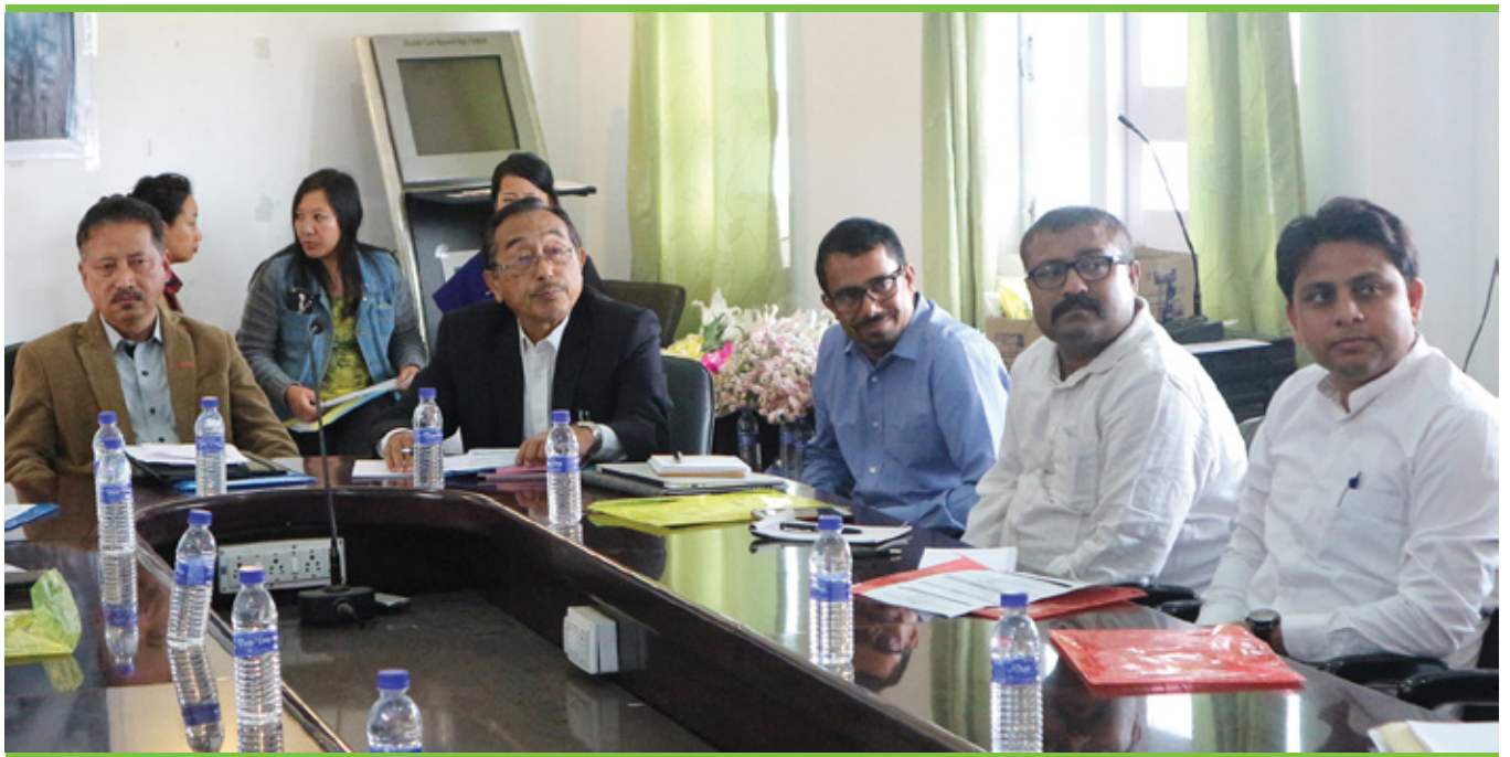
Participants during the State level Meeting on Social Protection in Kohima

A State level meeting on social protection for children of HIV infected Key Populations (KPs) and adolescent children of all KPs were held on 13 th of April, 2018 in Kohima. The meeting was attended by representatives from Social Welfare department, Education