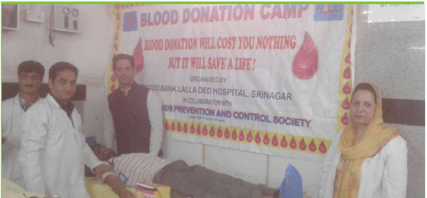
Volunteer donating blood during the blood donation camp

A blood donation camp in collaboration with Lalla Ded Hospital inaugurated by Hon'ble Minister of State Health and Medical Education, Govt of Jammu and Kashmir.