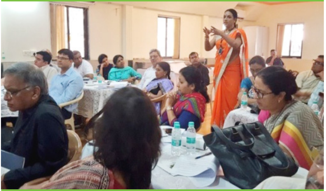
Participants interacting during the workshop on “Mumbai Fast-Track City Action Plan”

Mumbai is one of the first Indian cities to sign up for the Fast-Track Cities initiative. Since then efforts are being made by MDACS to reach 90:90:90 targets by 2020. To accelerate the progress, MDACS in coordination with UNAIDS arranged Workshop on Mumbai Fast Track City Action Plan on 10 th & 11 th April, 2018. Participants from the government, international & civil society organizations attended in the workshop. Following two days