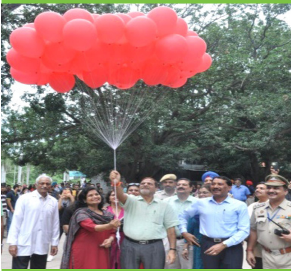
Launch of HIV/AIDS Awareness Campaign