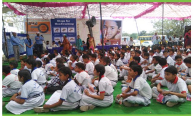
Dignitaries and participants during Screening Camp in J & K