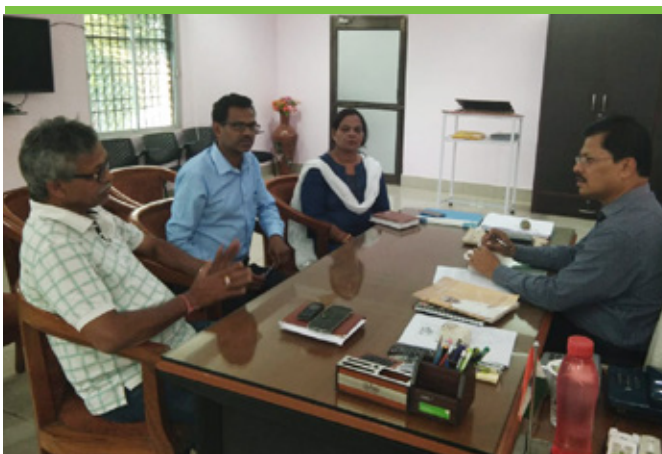
Meeting with CDMO and launching of HIV Screening by Collector Cum District Magistrate