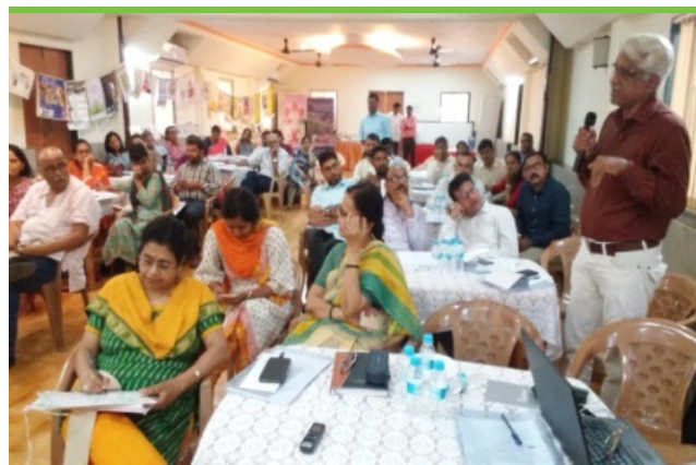
Dignitaries and participants during the Communication Strategy Workshop in Mumbai

Mumbai District AIDS Control Society has identified strategic communication as a key factor that could steer the program to reach 90:90:90 by 2020. With the support from UNAIDS, a stakeholder consultation was convened on 3rd May, 2018. Representatives from communities, NGOs, government sector participated. The best