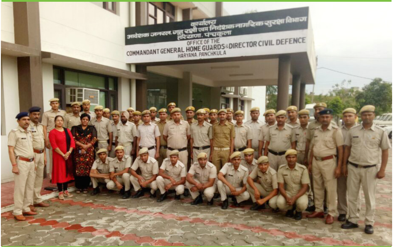
Participants during the Sensitization workshop with Homeguards in Haryana

A sensitization workshop with Homeguard Department was held in Commandant General Homeguards and Director Civil Defence, Haryana. In total, 42 Home guards were sensitized during the workshop.