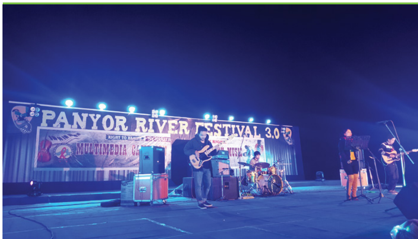
Rock band performing during Panyor River Festival

The three days long event at the bank of Serene Panyor River created an opportunity for the Arunachal Pradesh State AIDS Control Society to reach out to the youth in