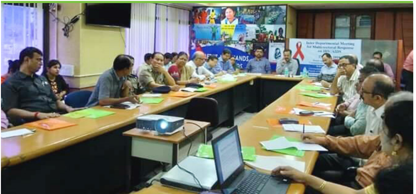
Inter-Department Meeting with various Ministries

WBSAP&CS organized Inter Departmental Meeting on 27 th July, 2018 in the presence of Department of Panchyat & Rural Development, Transport, Labour, Food & Supplies, Correctional Services, Urban Development and Municipal Affairs, Police Training School, Swami