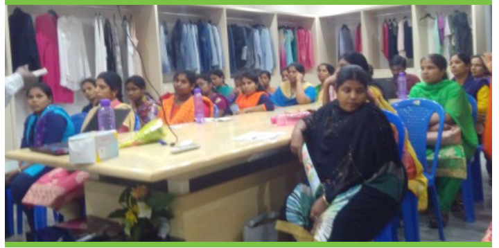
Participants during the ToT under ELM Programme

The Training of Trainers (ToT) was conducted for the nurses of the Shashi Exports Garments in Bengaluru under the Employer Led Model (ELM) programme on 26 th April, 2018. In total, 30 nurses from 30 units of Karnataka attended the ToT.