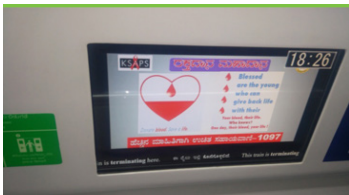
Voluntarily Blood Donation messages displayed in metro train

Karnataka State AIDS Prevention Society created awareness for the general population through an innovative approach by displaying electronic messages on blood donation inside the metro train for more than 15 days on the occasion of Voluntary Blood Donation Day. It was done free of cost and in collaboration with Bengaluru Metro Rail Corporation Limited. The train is running from morning 5.00 am to 11.00 pm in two lines covering appx. 41 kms. Lakhs of passengers travel in the metro train daily.