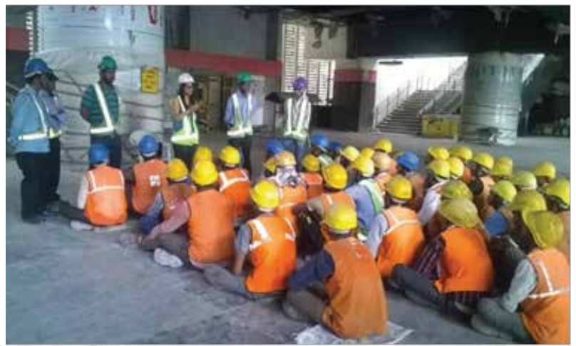
Awareness Program by paramedical staff of DMRC, Moti Bagh, New Delhi