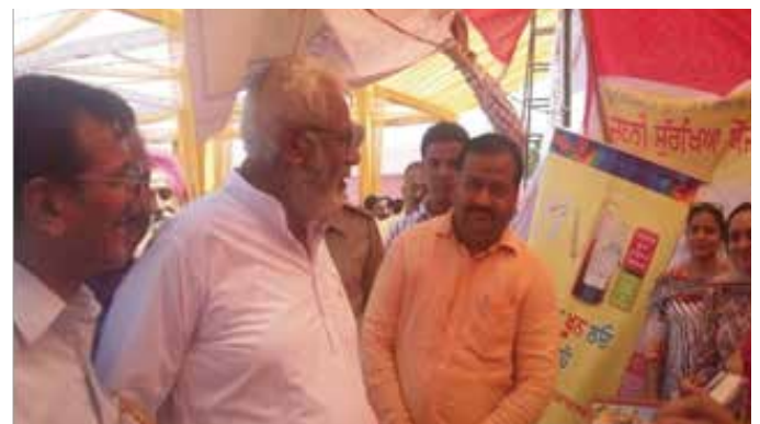
People Intracting during HIV/AIDS awareness exhibition at Ayush Mela

An exhibition on HIV/AIDS information was displayed in the " Ayush Mela " held at Sangrur from 21 st April to 25 th April, 2016 organized by the Department of Ayurveda, Punjab. The Hon'ble Health Minister, Punjab Shri Surit Kumar Jayani inaugurated this event. Out of the total visitors 159 visitors were counselled & 108 got themselves tested for HIV with zero negative result. 25 blood units were collected by Mobile Blood Donation Bus during the event. 15000 HIV/AIDS folders were distributed to the visitors.