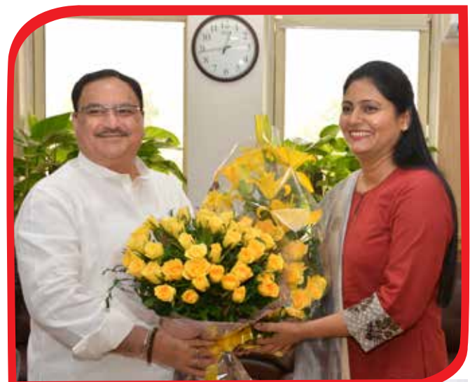
Smt. Anupriya Patel Hon'ble Union Minister of State, (MoHFW)