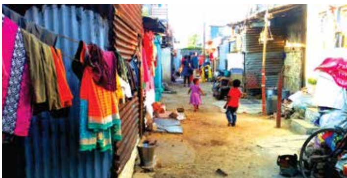
CABA empowerment through Child Parliament

The predominant danger that was identified by the Child Parliament was that posed by snakes and rodents that frequented an empty site besides the hostel. In a bid to stop the snakes from living in that patch of land, the Child Parliament decided to clean it on their own after a discussion.