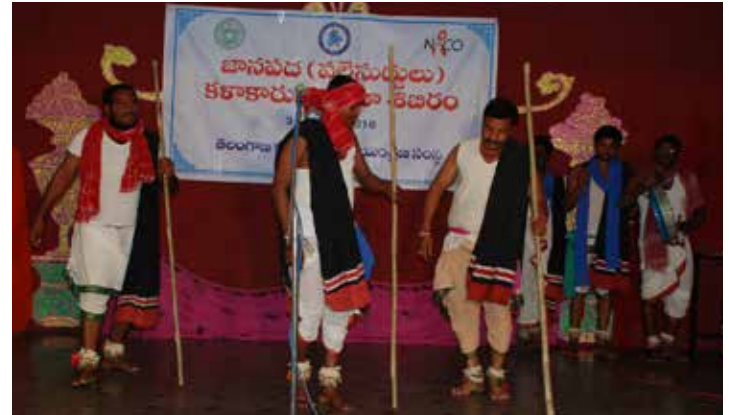
Folk Media Artist Performing on Stage

Medaram Jatara is one of the biggest tribal jatara in Asia. It is being celebrated biennially in Medaram village. About eighty lakh to one crore people from all across the State as well as other States like Maharashtra, Odisha, Chhattisgarh, Karnataka & Jharkhand had attended the function and done the darshan of the deities, who were brought from the forest and seen off after three days of the worship. In this regard, IEC division planned & successfully completed the 3 - day training program for the Folk artists on the Pallesuddulu format, which is very popular traditional theatre art form in Telangana State. One resource person for two districts assigned to train the teams. Resource persons and teams stayed together for three days and completed the in-house training, which was