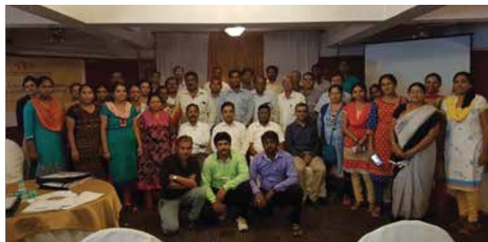
Group Photo of Trainers during first line Anti Tubercular Treatment Training

In this regard, National AIDS Control Organization and Central TB Division conducted 3 day Training of Trainers (ToT's) regarding "Daily Regimen for first line Anti Tubercular Treatment (ATT) for all HIV/TB co-infected patients and 31 st Intensified Case Finding (ICF), Isoniazid Preventive Therapy (IPT) & Air Borne Infection Control (AIC) strategies for ART Centres" at Centre of Excellence (CoE), Maulana Azad Medical College,