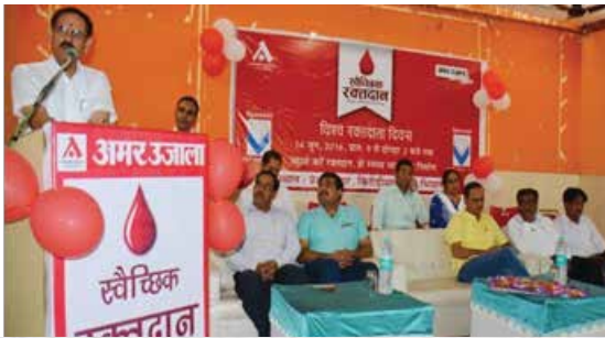
A Seminar on World Blood Donor Day

World Blood Donor Day was observed on 14 th June, 2016 and the day was celebrated all over the State by organizing activities like, poster rally, display of banner, honoring of donors / motivators /organizers, seminars, workshops, etc. June, 2016, 21 blood donation camps were organized 1914 blood units & during the campaign total number of 94 camps were organized by collecting 6189 blood units.