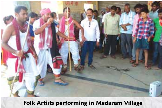
Folk Artists performing in Medaram Village

The IEC division has geared up the efforts and tried to roll out the activities at its best especially the priority activities in order to reach out to the different segments of Target Groups.