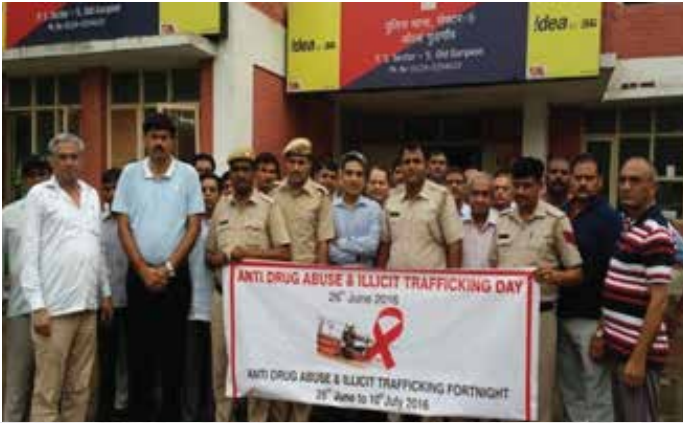
Rally at Gurgaon on Drug Abuse

Drug Abuse & Illicit Trafficking Fortnight was observed from 26 th June, 2016 to 10 th July, 2016 throughout Haryana. The activities were conducted during the fortnight: pocket IEC on HIV/AIDS read at Registration Counter daily, Promotion of National Toll free Helpline No. 1097, awareness on STIs focusing female patients, one month radio campaign on Drug Abuse: 2 Radio Jingles from 5 stations of All India Radio i.e. Chandigarh, Rohtak, Kurukshetra, Hisar & FM Delhi on Drug Abuse were broad-casted from 10 th June to 9 th July, awareness at Briklin Sites, Construction Sites, Truck Unions, Migrant areas etc, HIV/AIDS. The fortnight long event was marked by the Drug Abuse session by the District Nodal Officers followed by screening of special movie TEACH AIDS essay writing competition conducted in 19 District Institute of Elementary Teachers Training & Govt. Elementary Teachers Training Institute on 26 th June, 2016, poster making competition on HIV/AIDS & Drug Abuse were also conducted in all Senior Secondary schools in Haryana, AIDS awareness messages written on benches of General Hospital Rewari & sensitization session conducted at Bhondsi Jail, Gurgaon.