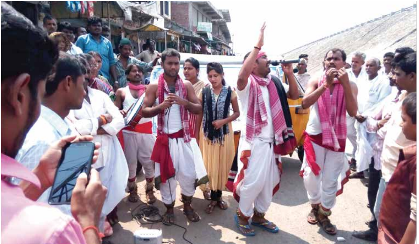
Performance by Folk Media artist