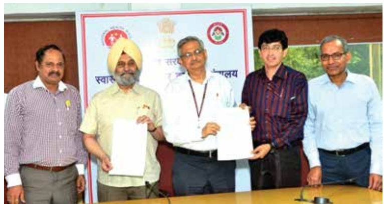
MoU between Union of India & state of Tamil Nadu for 'establishment of metro blood bank center of excellence for blood transfusion services' in Chennai on 14 th June, 2016