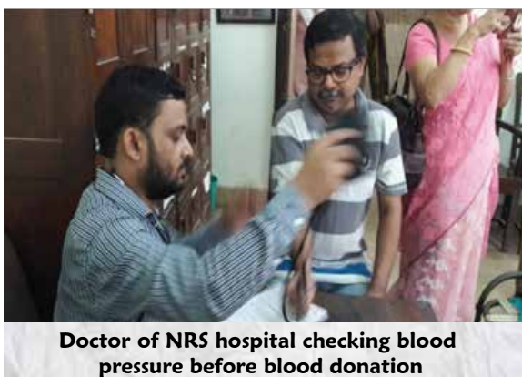
Doctor of NRS hospital checking blood pressure before blood donation