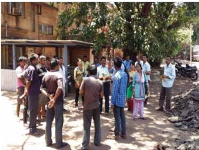
Group session on HIV/AIDS at MPT, Goa May, 2016

limit spread of HIV epidemic. Towards the end of May, 2016 a total of 304 Industries have come on board across 127 districts in 25 States covering 30 Industrial sectors. About 2.62 lakh migrants are covered through different activities during this program. Out of which 3523 person are counselled & tested for HIV. 970 persons are treated for any STIs & 6 HIV positive persons have been referred for ART services.