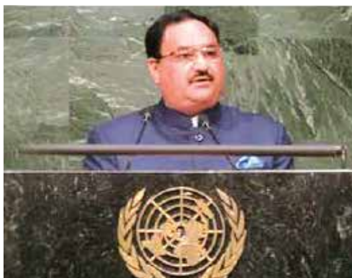
Shri Jagat Prakash Nadda, Hon’ble Union Minister for Health & Family Welfare delivering speech during High level meeting (HLM)