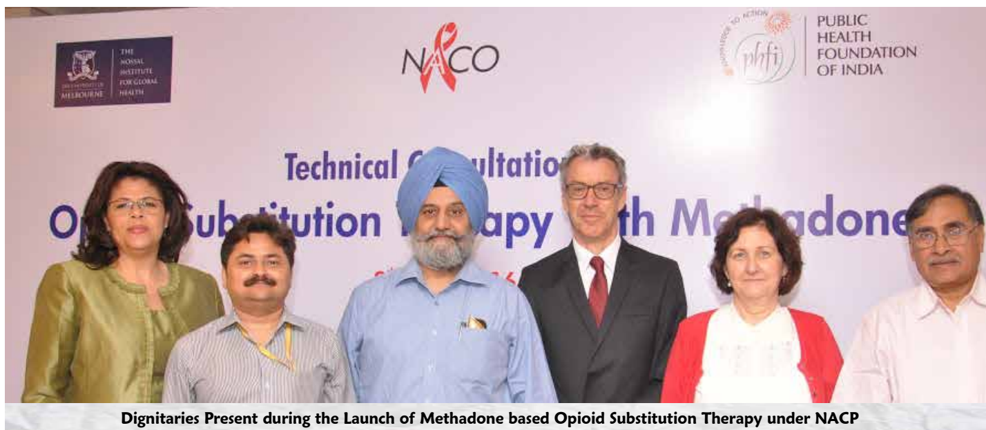
Dignitaries Present during the Launch of Methadone based Opioid Substitution Therapy under NACP