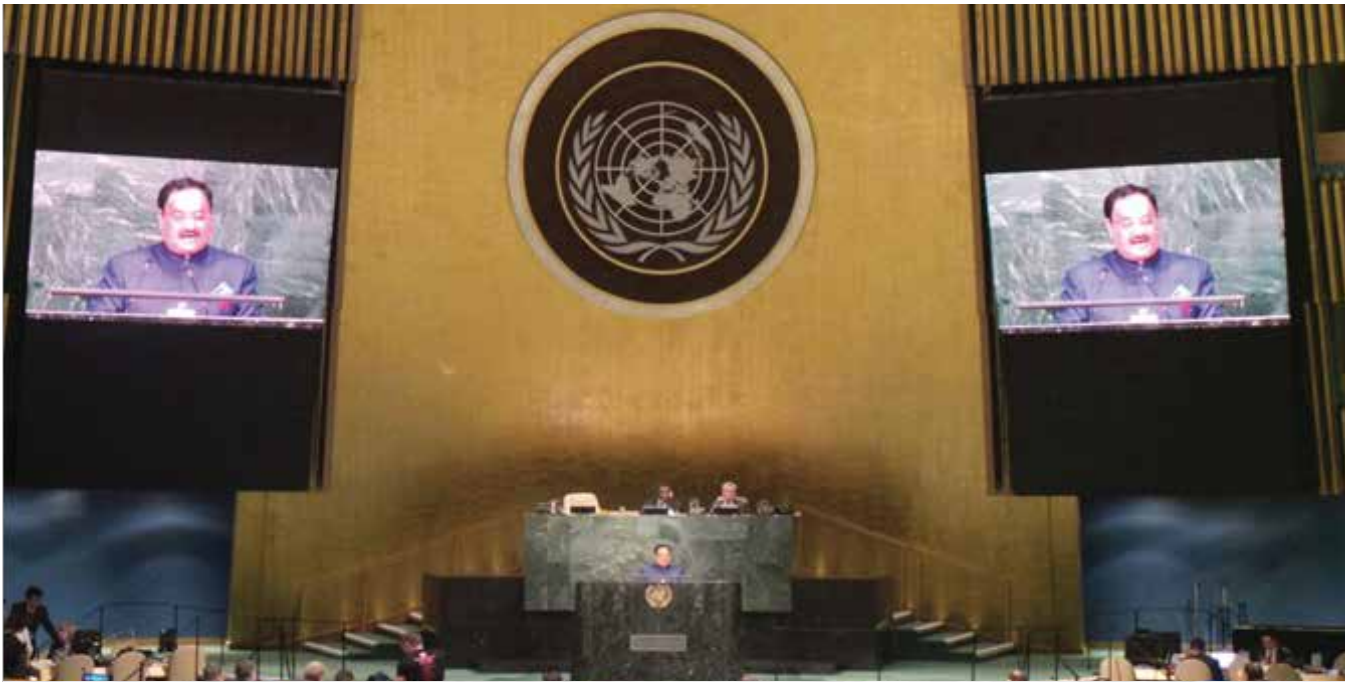
Shri Jagat Prakash Nadda, Hon'ble Union Minister for Health & Family Welfare delivering speech during High level meeting (HLM)

He said that these remarkable successes have demonstrated that the target of ending the AIDS epidemic by 2030 is realistic and that a sustained political commitment and action is necessary to address the scale of challenge that still lie ahead. He expressed his satisfaction that India is leading the scene as one of the most efficient partner in the global fight against AIDS epidemics.