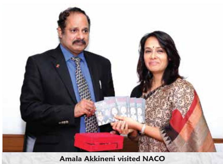
Amala Akkineni visited NACO