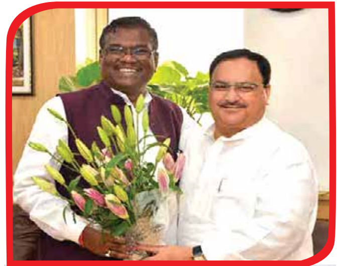
Shri Faggan Singh Kulaste Hon'ble Union Minister of State, (MoHFW)