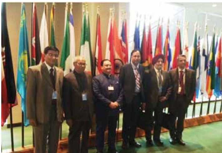
Shri Jagat Prakash Nadda, Hon’ble Union Minister for Health & Family Welfare along with delegation