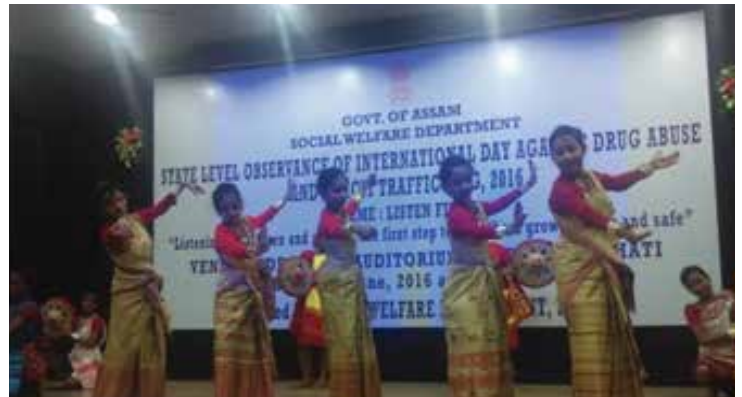
The Artist performing on stage