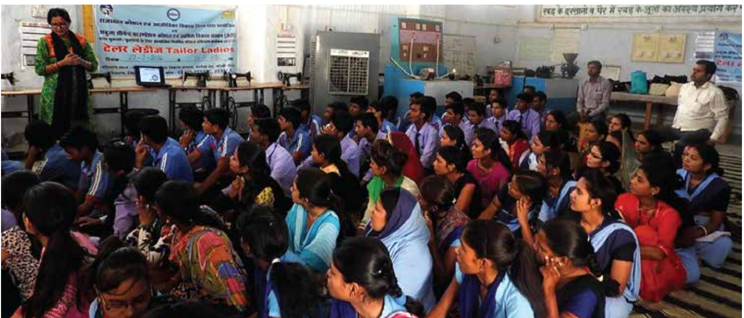
ELM activities conducting in Rajasthan

National Migration Unit, TI Division, NACO