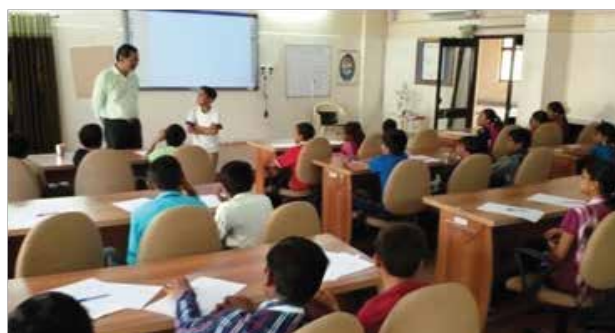
Participants attending one day workshop on imparting knowledge on healthy behaviour & stress coping