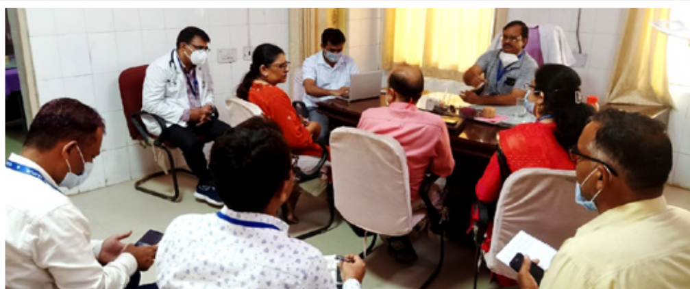
Interaction of NACO Team with Principal Medical Officer, Kotputuli Govt. District Hospital, and Officials of Rajasthan SACS

of vulnerability of the key population, approaches to extend outreach services to the population who are not able to come to the facilities to receive services, and integration of services. It was also highlighted that there is a need to strengthen the collaboration among development partners working under different public health schemes in the state and with SACS to optimize the resources being invested in the response to meet the goals set under the NACP.