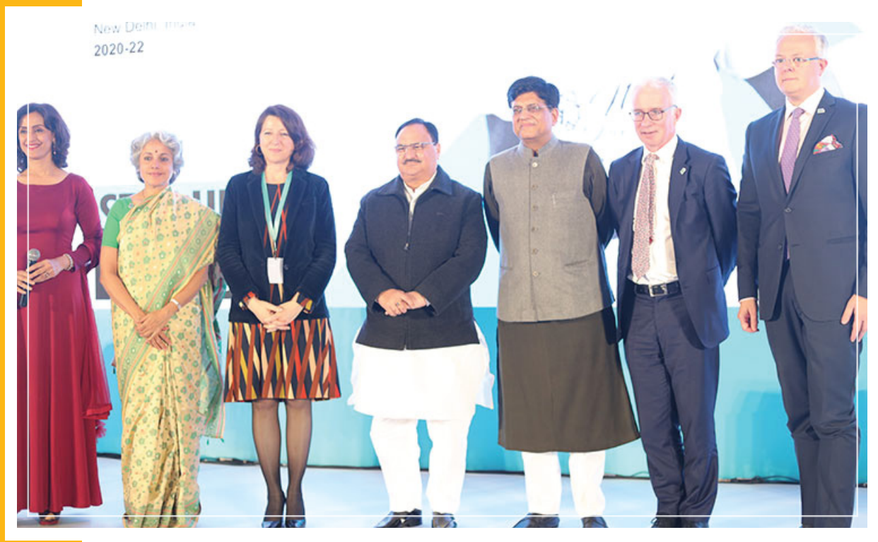
Shri Jagat Prakash Nadda, Hon'ble Union Minister for Health & Family Welfare, Government of India along with dignitaries during Preparatory Meeting of the Global Fund 6<sup>th</sup> Replenishment

A high level preparatory meeting for the Sixth Replenishment Conference of the Global Fund was hosted by India on 7<sup>th</sup> & 8<sup>th</sup> February, 2019 in New Delhi. The preparatory meeting was aimed at setting stage for the Global Fund to launch its investment case for its 6<sup>th</sup> replenishment conference and its fund mobilization campaign and to mobilize needed resources to scale up life-saving programs over 2020-22.