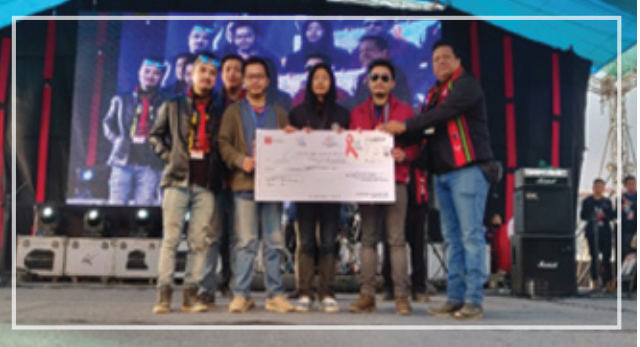
Band' from Nagaland