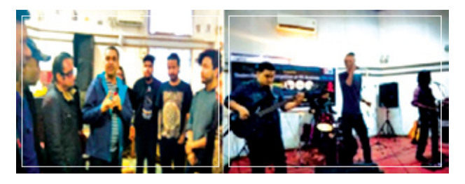
Participants during State level Western Rock Band Competition

The State level Western Rock Band Competition on HIV awareness was conducted in Guwahati on 20<sup>th</sup> January, 2019. A total of four rock bands had participated namely Bottle Rockets, Battle of Symphony, Existence after Trestle, Tyrenian. The Tyrenian was the winner of the competition. There was one inspiring performance by the band –"Judges". The Guest of Honour, Commissioner Secretary Health cum Project Director, Assam SACS had also appreciated the Western Rock Band Competition.