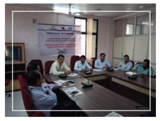
NACO in collaboration with ILO and Gujarat State AIDS Control Society (GSACS) organized consultations on 'Fast Track VCT@Work'

World of work response to HIV is one of the strategic priorities of National AIDS Control Programme in India. NACO through State AIDS Control Societies in collaboration with ILO has made several efforts to strengthen engagement of industries of public and private sector, employer organizations and other key stakeholder and also to reinforce national response to HIV and AIDS in the world of work and to promote voluntary testing among workers through campaign 'VCT@Work'. To move ahead with an agenda to strengthen 'VCT@Work' campaign, NACO in collaboration with ILO and Gujarat State AIDS Control Society (GSACS) has successfully organized consultations on 'Fast Track VCT@Work' in the three priority districts of Gujarat namely Ahmedabad, Surat and Jamnagar on 11<sup>th</sup>, 13<sup>th</sup> and 18<sup>th</sup> March, 2019 respectively.