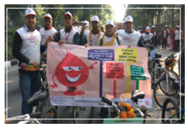
Participants during Culmination Ceremony of Swastha Bharat Yatra

DSACS participated in Culmination Ceremony of Swastha Bharat Yatra on 29<sup>th</sup> January, 2019 in collaboration with Dept. of Food safety, GNCTD and Food Safety Standard Authority of India. HIV/AIDS awareness and VBD motivational talks were organised and IEC material were also distributed during Culmination Ceremony of Swastha Bharat Yatra .