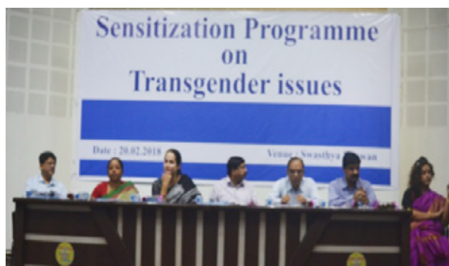
Dignitaries during sensitization programme on transgender issues