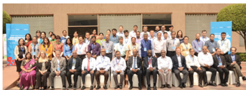
Participants during the Expert Consultation on Newer Methods of HIV Surveillance and Estimation in India