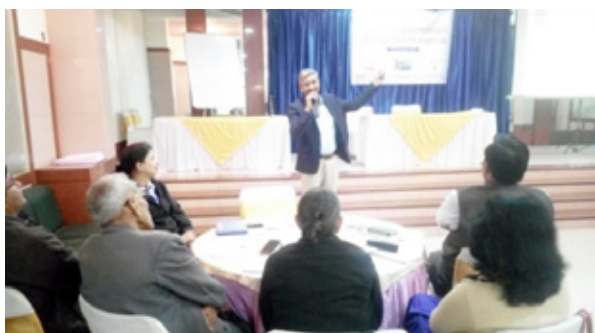
Experts and participants during State level Sensitization workshop in Rajasthan