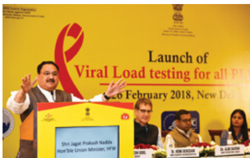
Shri J. P. Nadda, Hon'ble Union Minister of Health and Family Welfare during the launch

Shri J. P. Nadda, Hon'ble Union Minister of Health and Family Welfare, launched the "Viral Load testing for all People Living with HIV/AIDS" on 26 th February, 2018. The initiative will provide free of cost viral load testing for more than 12 lakh PLHIV on treatment in the country, at least once a year.