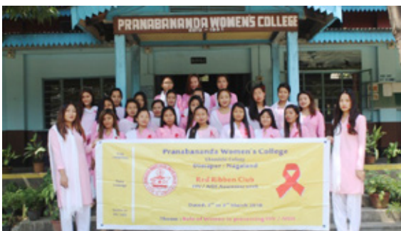
Members of Red Ribbon Club during HIV & AIDS Awareness Week

The Pranabananda Women's College Red Ribbon Club, Dimapur, Nagaland conducted HIV & AIDS Awareness Week from 5 th to 9 th March 2018, on the theme, "Role of Women in Preventing HIV& AIDS". A Poster Campaign, Essay Competition and Seminar were organised at the College Auditorium.