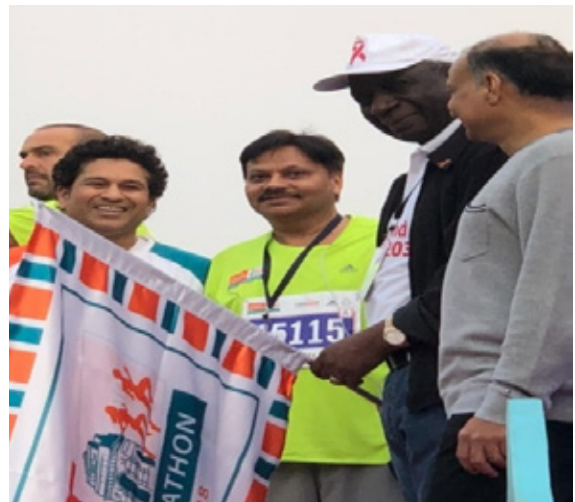
Former Captain and legend of the Indian cricket world, Sachin Tendulkar flagging off the Marathon