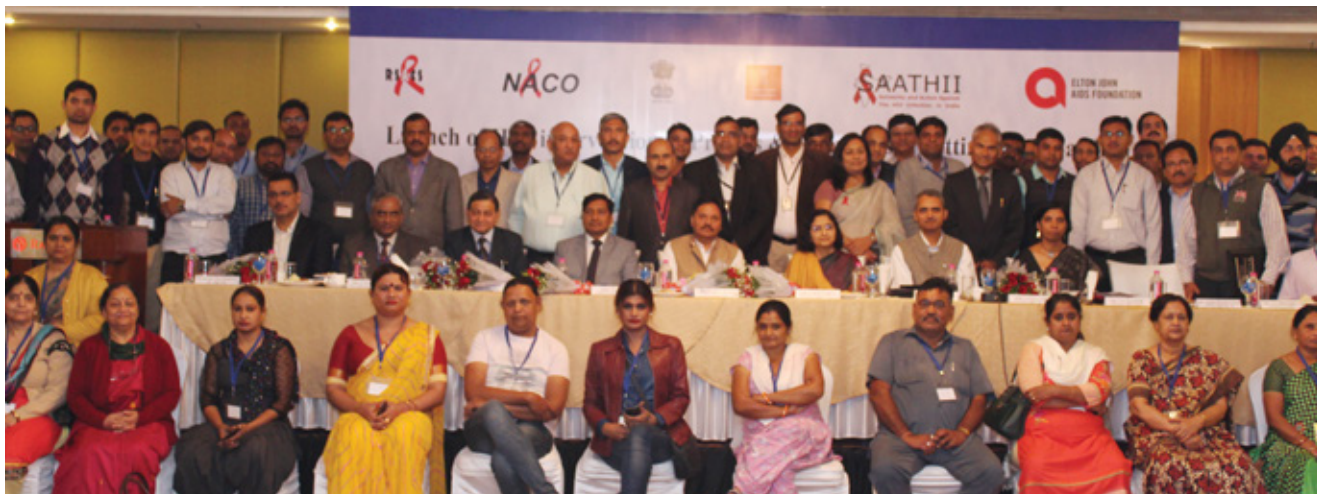
Participants during the launch of HIV Intervention in Prisons and Other Closed Settings in Rajasthan