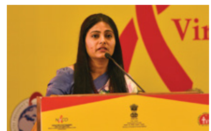
Ms. Anupriya Patel, Hon'ble Union Minister of State for Health & Family Welfare

Ms. Anupriya Patel, Hon'ble Minister of State for Health & Family Welfare, Government of India stressed that it is indeed great day for all of us for fighting HIV/AIDS with a named to be eliminated in India, we are committed to provide any support require from our end.