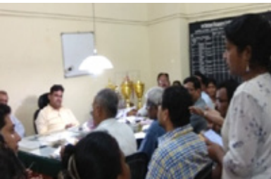
Discussion is in progress during Advocacy & Social Protection Camps at Rationing Offices

To enhance access of schemes by PLHIV/CLHIV/FSW/TG, two regional advocacy programs were conducted at D & E region for 87 Rationing Officers and Asst. R.O. & Inspectors. Dy. Controller, rationing, instructed the officers to provide full support to MDACS & NGOs, in terms of HR & other logistics arrangements during the camps.