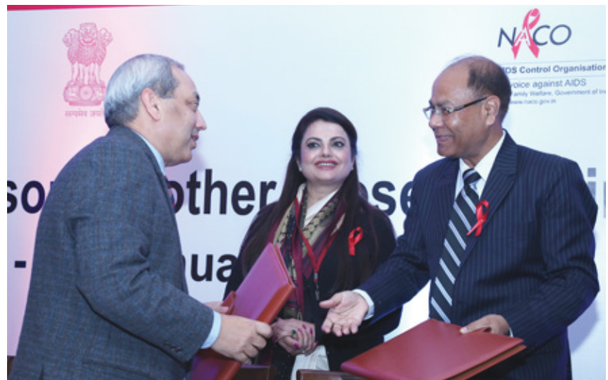
A Memorandum of Understanding (MoU) was signed between the Haryana SACS and State Prisons Department

A Memorandum of Understanding (MoU) was signed between the Haryana SACS and State Prisons Department. The launch event