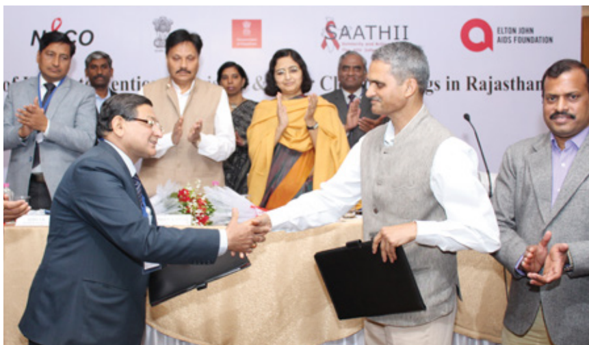
Rajasthan State AIDS Control Society and Dept. of Prisons, Govt. of Rajasthan signed MoU to rollout HIV intervention in prisons and other closed settings