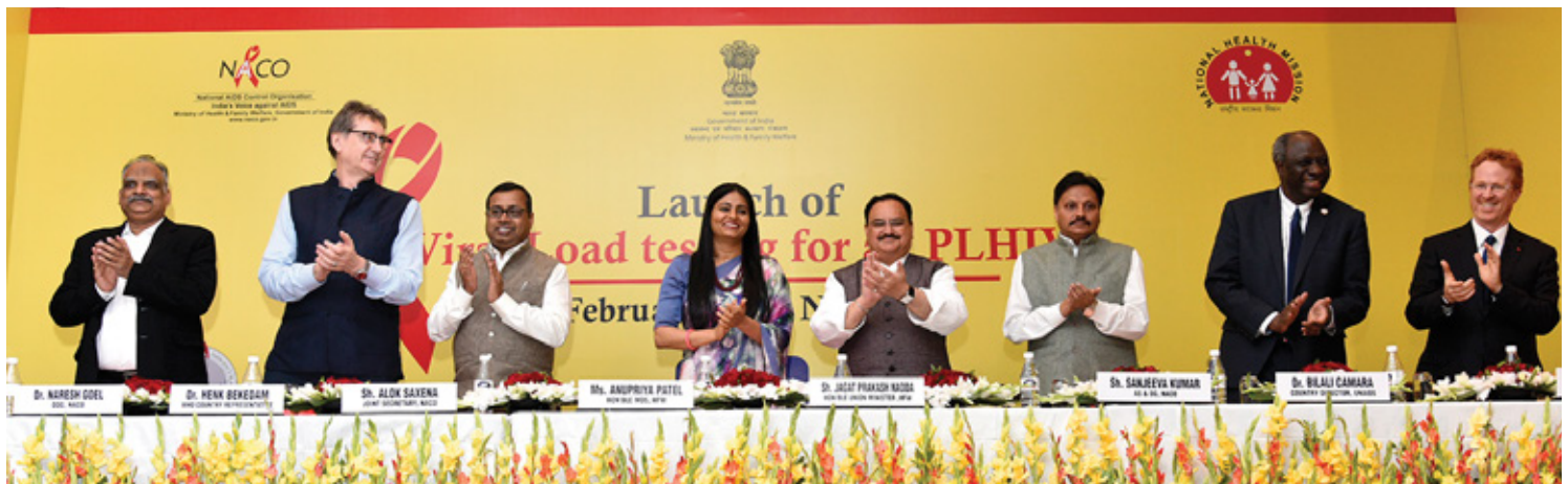
Shri J. P. Nadda, Hon'ble Union Minister of Health and Family Welfare, along with other dignitaries during the launch of "Viral Load testing for all People Living with HIV/AIDS"

Shri J. P. Nadda, Hon'ble Union Minister of Health and Family Welfare, launched the "Viral Load testing for all People Living with HIV/AIDS" on 26 th February, 2018. The initiative will provide free of cost viral load testing for more than 12 lakh PLHIV on treatment in the country, at least once a year.