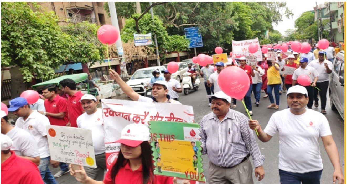
Glimpses of the rally

In addition to the Walkathon conducted on the World Blood Donor Day, thoughtout the month, rallies and blood donation camps were also organized at various hospitals in Delhi i.e. GTB Hospital in East Delhi, Akash Hospital, Dwarka in South West Delhi, GB Pant Hospital in Central Delhi, BSA Hospital, Blood Bank in Rohini, North West Delhi and a community event by AIIMS in South Delhi.