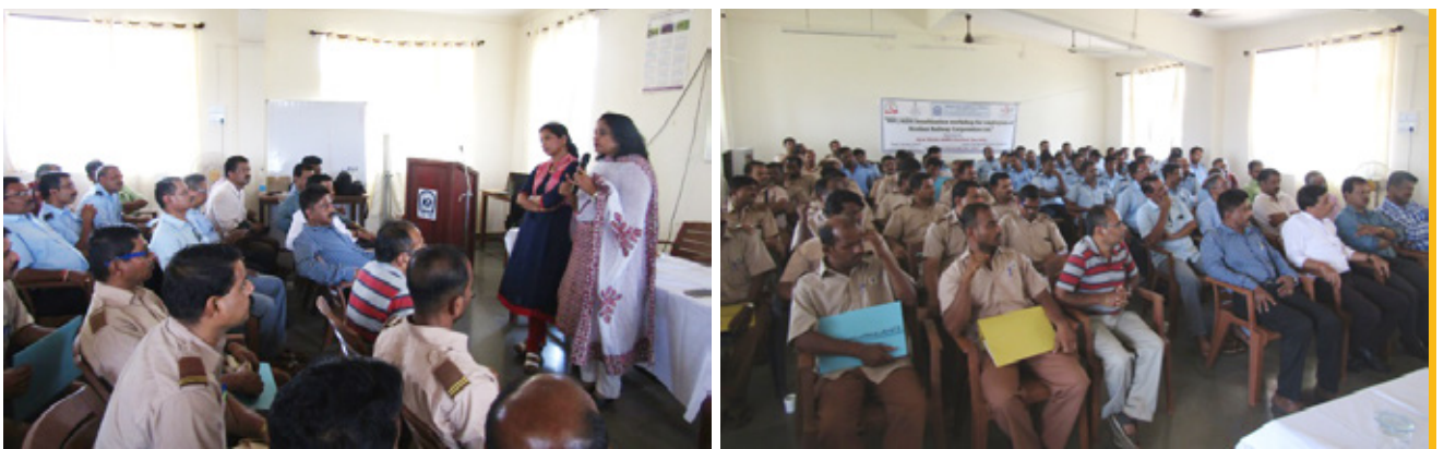
Glimpses of sensitization session