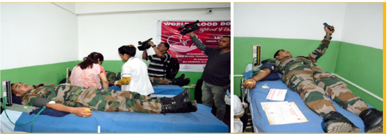
Glimpses of VBD

Activities like music performance by bands, prize distribution for significant contribution in the field of Voluntary Blood Donation at state level and blood donation camps were also conducted in order to raise awareness among all groups of population.