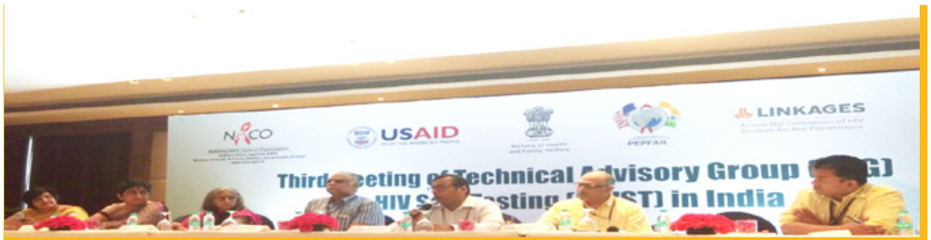
A panel discussion was also held on Unassisted Self-Testing in Indian Context, Challenges and Opportunities