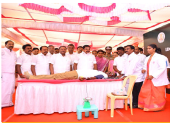
Hon'ble Chief Minister, Government of Tamil Nadu, presided and inaugurated the camp

TANSACS and TNSBTC in association with Tamil Nadu Police Department have inaugurated Mega Voluntary Blood Donation Camp on 21 st June, 2019 at Rajarathinam Stadium, Chennai and organized Voluntary Blood Donation Camps throughout Tamil Nadu. The initiative achieved huge success throughout the state. Active participation from Senior Officials motivated and ensured participation from the bottom most employees. During the camp 9,087 units of blood were collected from Police Department throughout the state.