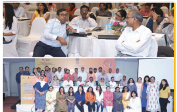
Capacity Building of the ART Staff

The participants were also given a demonstration on Communication Techniques for conducting Verbal Autopsy Interviews.