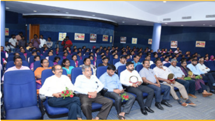
Audiences at the World Blood Donor Day

Nine organisations were felicitated during the event, namely, The Commanding Officer Bambolim3 TTR/5TTR, Betts India, Commscope (Andrew Telecommunication Ltd.), Village Panchayat Nagoa, Canacona Saraswath Samaj, Lions Club of Cavelossim, Helpline Ponda, Glenmark, Colvale, Hanuman Sports and Cultural Club, Taleigao for their exemplary contribution in the field of blood services in Goa.