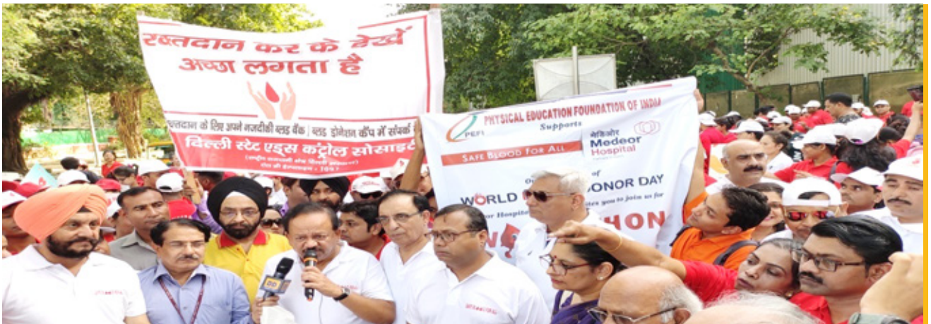
Dr. Harsh Vardhan, Hon'ble Minister of Health and Family Welfare, Govt. of India addressing the participants during the Walkathon