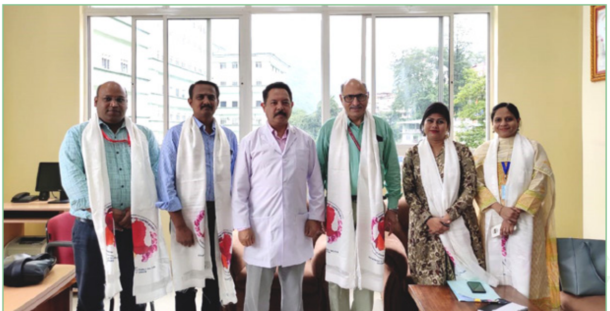
Figure 5: Visit to Sikkim during 7 th -10 th June 2022