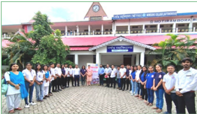
Figure 1: Visit to Assam during 17 th -21 st May 2022