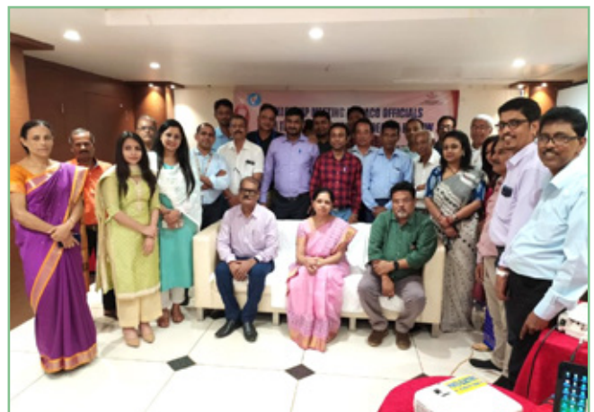
Figure 4: Visit to Tripura during 1 st -3 rd June 2022