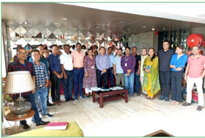
Figure 3: Visit to Manipur during 27 th -28 th May 2022