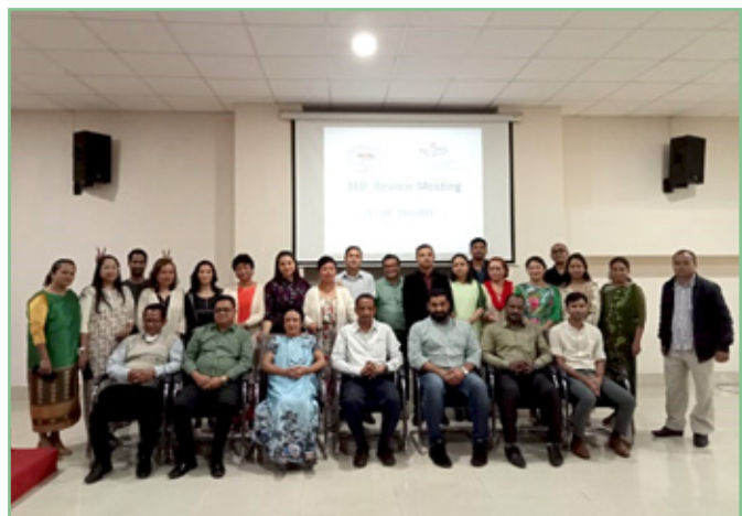
Figure 2: Visit to Meghalaya during 24 th -28 th May 2022